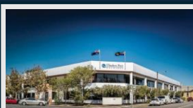
296 St, Vincent Street, Port Adelaide SA