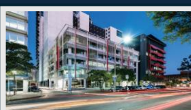
70 Light Square, Adelaide, SA